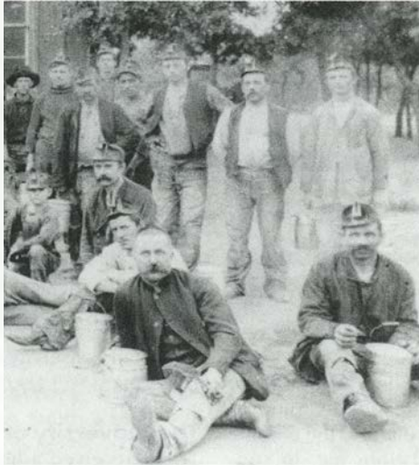
Miners in Thurber, Texas, circa 1906.

Thurber, a company town wholly owned by the Texas and Pacific Coal Company, was home to the miners who worked the local coal deposits and was distinguished by its considerable ethnic diversity; between 18 and 23 European nationalities were reportedly represented in Thurber. A significant feature of the town's history, which began in 1888, is its labor strife