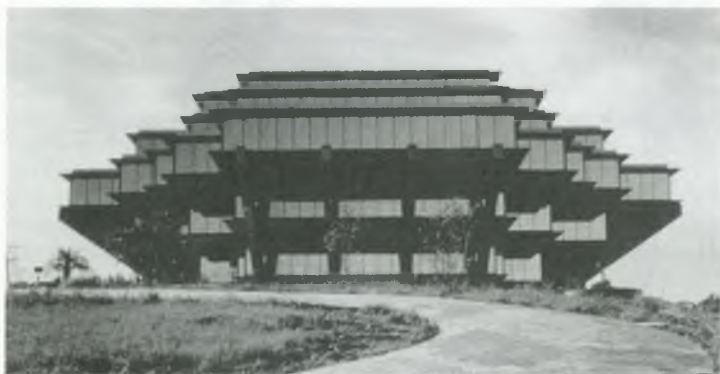
The University Library building at the University of California, San Diego, caught the fancy of Theodor Geisel, a.k.a. Dr. Seuss.