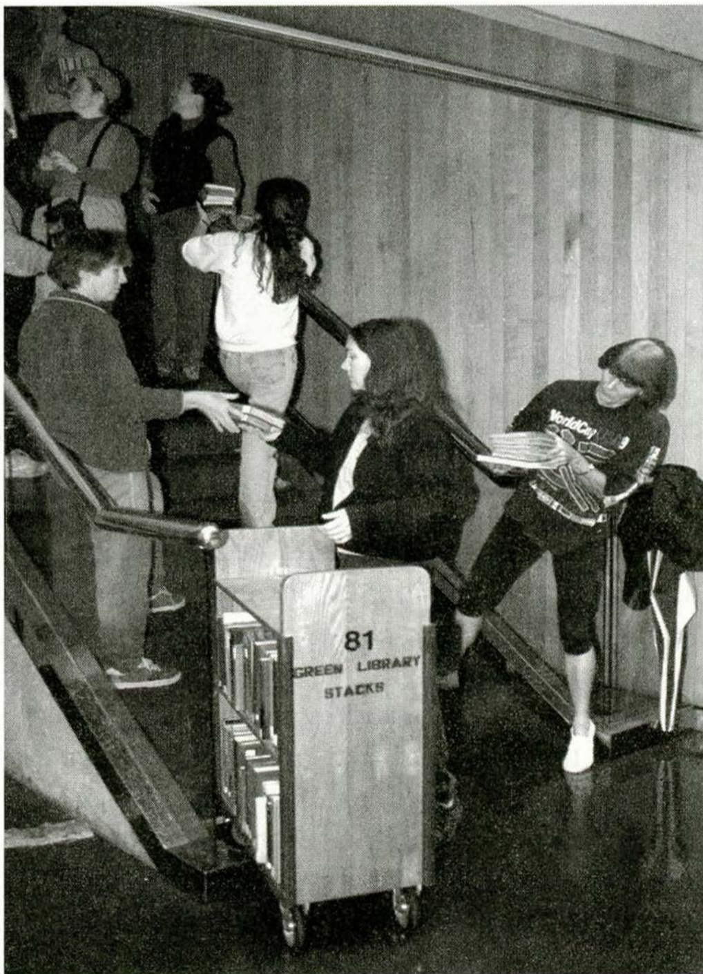
Library staff and student volunteers moved 120,000 books out of the flooded basement of Stanford University's Green Library.

It takes about ten days to dry out 8,000 books and the entire process, which was scheduled to begin in late March, is expected to take four to five months to complete.