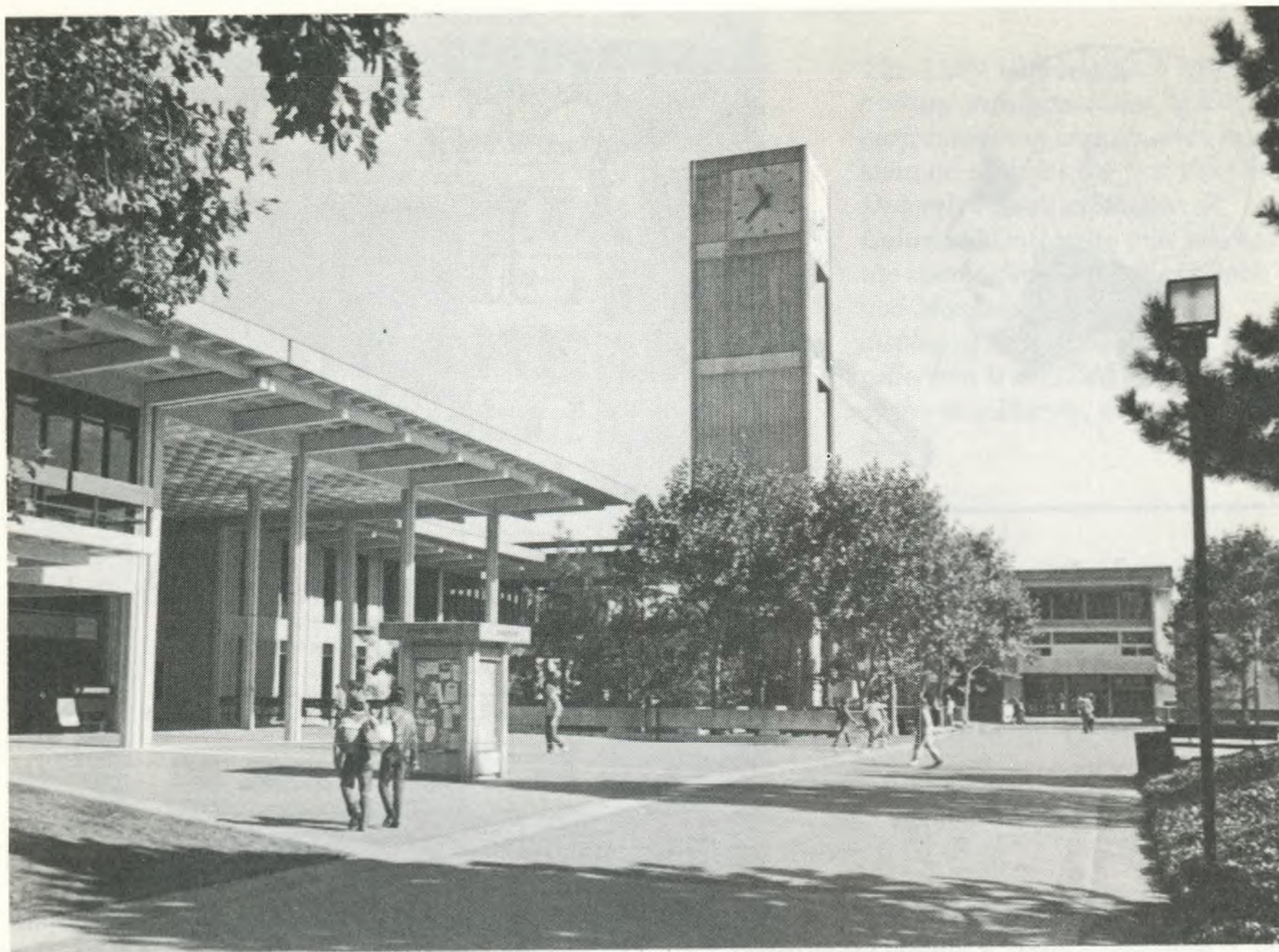
The Evergreen State College Library, Olympia, Washington.