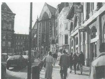
This is a view of the "New Church" in Amsterdam, which has the book exhibit "Alphabet Soup."

Twenty poster sessions ranging from topics