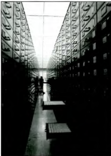
Housed on the 26th floor of the L.D.S. Church Office Building, the genealogical library is the largest of its kind in the world, and open to the public.