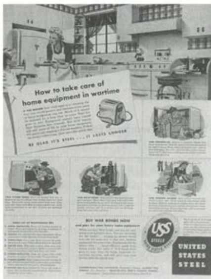
An ad from the D'Arcy Advertising Collection, a collection at the University of Illinois at Urbana-Champaign Communications Library.