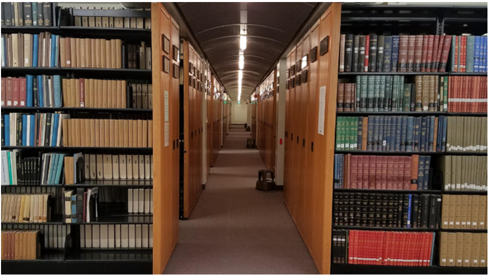
The government information collection in compact shelving at Utah State University Libraries.

The inventory prioritized shelf composition and measurement of materials (extent) over a physical count. As it was designed to collect information about shelf contents and identify preservation needs, the inven-