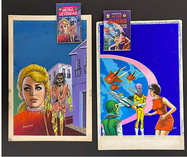
Samples of original cover art from the SDSU Mexican pulp collection.

Established in 1947 as the scholarly publishing arm of MSU, the press today has nearly 1,000 titles in print. Its mission has been to act as a catalyst for positive intellectual, social, and technological change through the publication of research and intellectual inquiry, making significant contributions to scholarship in the arts, humanities, sciences, and social sciences. The press’s journals division publishes 15 award-winning academic journals, all