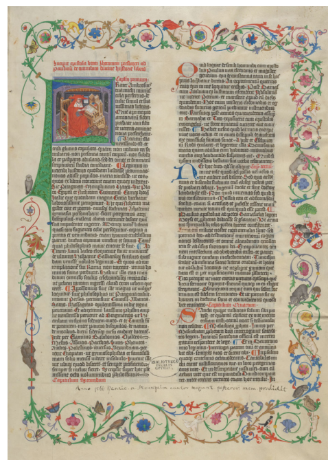
Cover of the Giant Bible of Mainz.