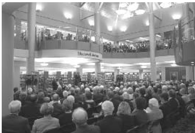
The Blackwell Atrium of Furman University's James B. Duke Library during the October dedication ceremony.

The complete 2004 e-book best sellers list can be found online at www.openebook.org/bestseller/year04.htm .