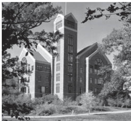
Thomas Tredway Library at Augustana College

"The staff have developed a number of exciting and often quite innovative collabo-