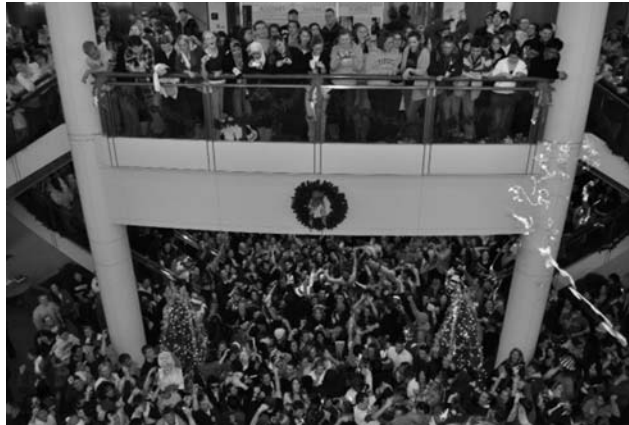
Marquette University students at the December “flash rave.”

Free at Last? Slavery in Pittsburgh in the 18th and 19th Centuries, a recent display at the University of Pittsburgh’s (UP) Senator John