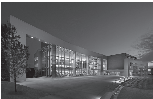
North façade and plaza at night at the Georgia Gwinnett College Library and Learning Center.

The U.S. Green Building Council awarded the Leadership in Energy and Environmental Design (LEED) Gold certification to the recently completed Georgia Gwinnett College (GGC) Library and Learning Center in Lawrenceville, Georgia. Designed by international architecture, planning, engineering, and interior design firm Leo A. Daly, GGC's facility is the first academic library in Geor-