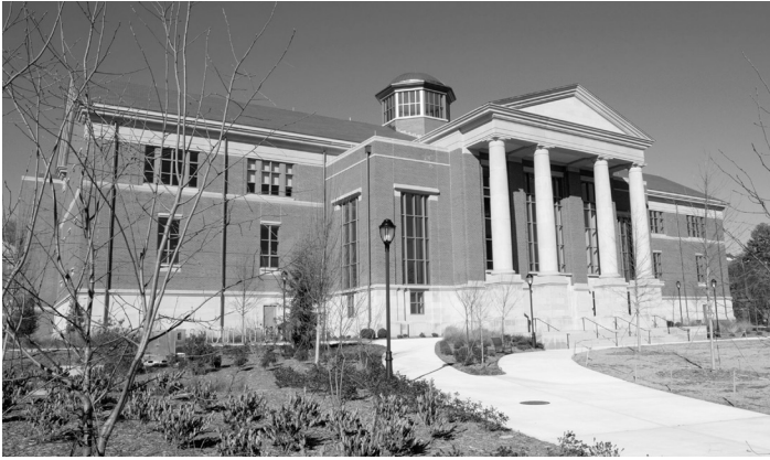
The new Richard B. Russell Building at the University of Georgia.

The University of Georgia (UGA) has completed a new state-of-the-art special collections facility, the Richard B. Russell Building, to house the Hargrett Rare Book and Manuscript Library, the Russell Library for Political Research and Studies, and the Walter J. Brown Media Archives and Peabody Collection. The university broke ground for