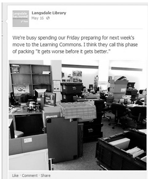
Using Facebook to give updates on their relocation.

When we created our social media policy, we started by documenting the procedures we were currently using, without modifying any existing power or responsibilities. We considered our library culture that encourages creativity and inclusion, and left our policy less restrictive than other library social media policies we reviewed. Along those lines, we used positive language