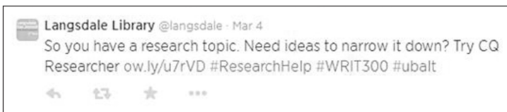
Tweeting resources for a writing class.

Extensive planning, while helpful, can leave you lost in the details. It is important to not let the