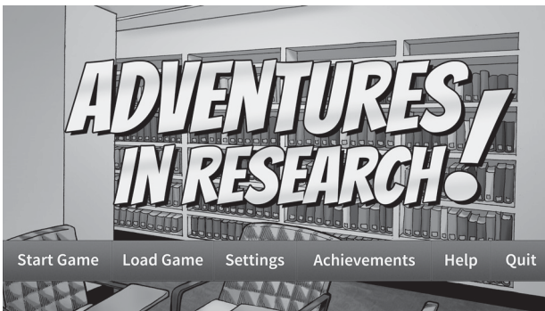
Title screen from Adventures in Research , https://db.tt/Ca0h-KAE2 . Artwork by Heidi Black. View this article online for more detailed images.

It was decided that a video game might be the best option. Through playing a game