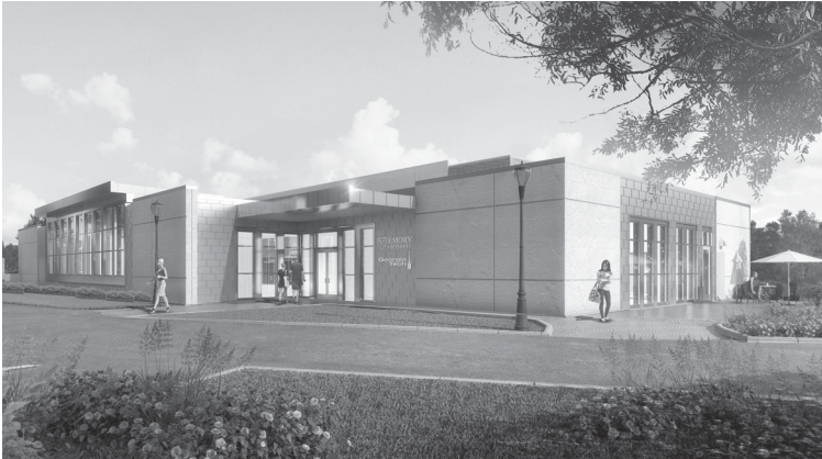
Rendering of the Emory-Georgia Tech Library Service Center.

The majority of collections currently in the Georgia Tech Library will move to the