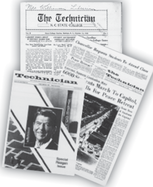
A selection of archival covers from NCSU's student newspaper the Technician .

The Kelvin Smith Library at Case Western