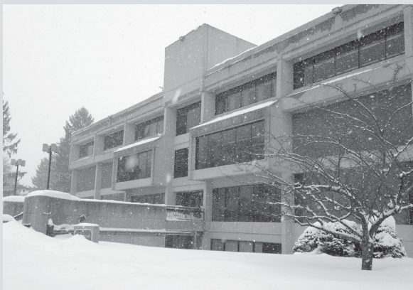
The Babson Library during a recent snow storm.

a Massachusetts storm does not have much effect. This method of using technology to communicate and provide research assistance, as well as making judicious use of residential students, was a success for Babson Library this winter.