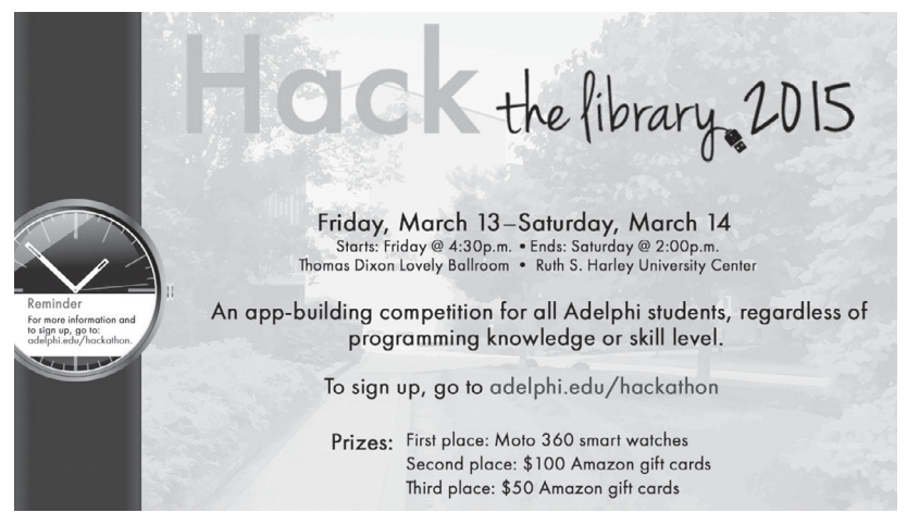
Hack the Library 2015 advertisement banner for digital and outdoor signage.

Volunteers and judges are crucial in events like these, and we established contact early with relevant departments, such as graphic design, computer science, and educational technology. This helped us sign on a lot of diverse volunteers and get word-of-mouth advertising to the students. As soon as we knew