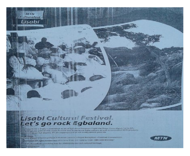
MTN Ad 2

are successful through their loyalty. That condescending allegiance informs the planting of more branches in strategic locations. As a result of that notification, the MTN team, as the ad asserts, derives some pleasures in rendering nice services to subscribers. The motivation for services, one could submit, is financial gains from subscribers rather than services rendered. In other words, the cash received through the consumers' patronage influences MTN consistent services to consumers.