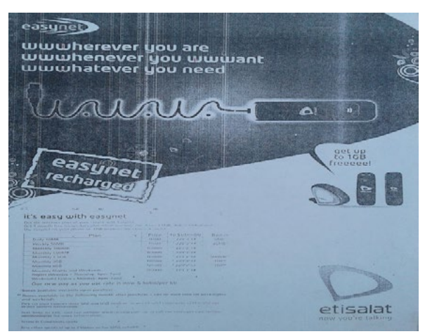
Etisalat Ad 1