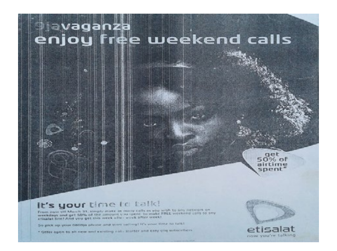
Etisalat Ad 2

In addition, the places where consumers can purchase the plan as well as the appropriate time of its enjoyment are demonstrated as at any etisalat experience centre and on weekninghts and weekends . These pieces of information become necessitated in order to clarify doubts on the product's availability and to ease the consumers' stress on the purchase of the service. The communicator consoles subscribers with clauses twelve and five. That is, Text 'help' to 229 and it's easy with easynet . Directing readers to 229 is perhaps an end to discomfort in purchasing the Internet plan, owing to the freedom that consumers could exercise by purchasing the product online. The convenience created alleviates some worries. To further satisfy the public, it's easy with easynet culminates the message to give readers a peace of mind. Such means could make consumers relax to benefit from the campaigned Etisalat data plan.