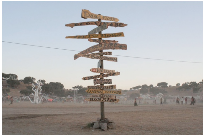
Figure 12: Boom Festival, Portugal, 2006.

the Dionysian experience on its various dance floors is a festal dynamic traceable to the 1960s model of the "Gathering". As a "Gathering of the Tribes" some forty years from its precedent, demonstrating inheritance from the tradition of carnival modulated by developments in alternative and electronic dance music culture over several decades, Boom is a psychedelic festival facilitating the simultaneity of fusion and difference I have called neotrance , while at the same time hosting the transgressive/reflexive dynamic implicit to its movement.