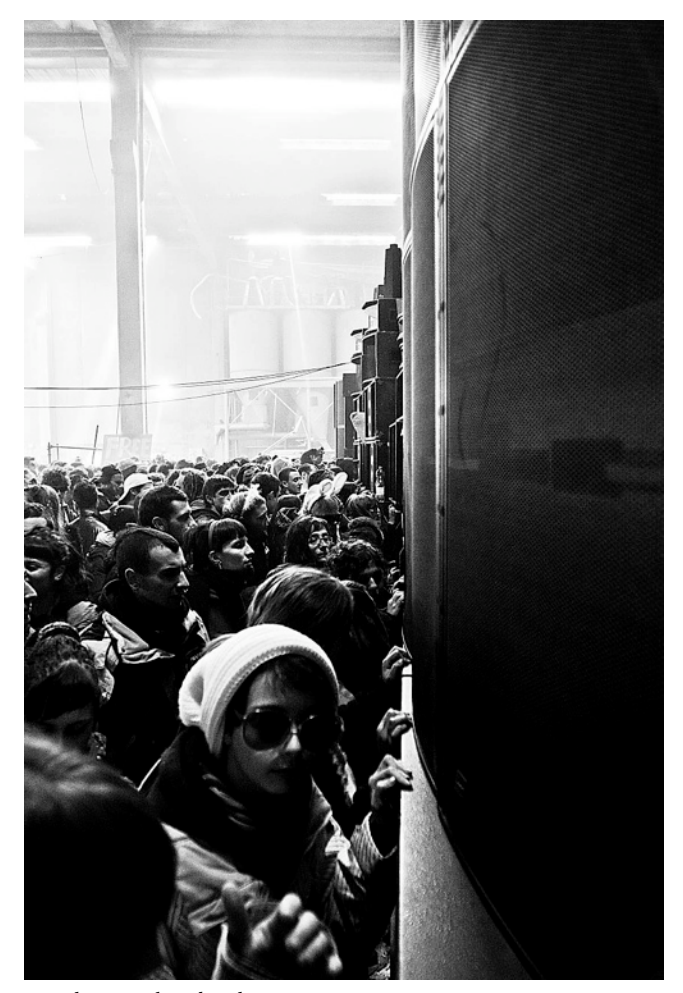
Figure 4: Karnival 2009.

moments of being together is considered to be a primary commitment of neo-tribes. According to this view, individuals groove between ephemeral sites of empathetic and amplified sociality, with multiple sites existing like portals in a shimmering galaxy. It is little wonder that dance researchers (e.g. Bennett 1999; Gaillot 1999; Gore 1997: 56-7; Malbon 1998; St John 2009) have found value in this interpretative lens, since, as a contemporary site of belonging and identification, the dance club, party or festival is legion.