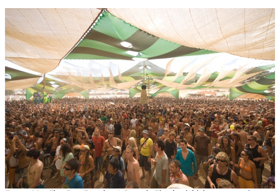
Figure 1: Main Floor, Boom Festival 2008, Portugal

psytrance, neotrance, psychedelic festival, trance states, religion, new spirituality, liminality, neotribe