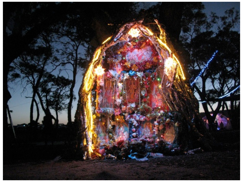
Figure 6: Shrine at Rainbow Serpent Festival, Australia, 2009.