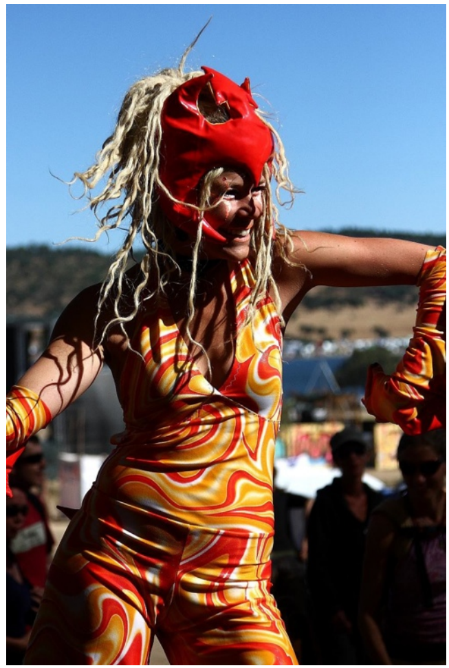
Figure 8: Boom 2008.

The psy-festival, therefore, allows its inhabitants multiple freedoms, including the freedom to join one's flame to the conflagration, and to hold self-promotions on and off the dance floor. Exemplifying the festal-life returning in the contemporary, Boom affords this commotion of singularity and freakiness, the dissolution and presentation of self-hood. Energised in rare fashion, across this spectrum one shifts between spectacular states of self(less)ness. Evincing the complex character of the "tribal" within this movement, participants may experience fusion with, or autonomy from, others in extraordinary states of altered consciousness.<sup>12</sup> Organisers of Boom, in collaboration with DJs, producers, sound engineers, visual and décor artists, optimise space, time, art and other resources to realise the dynamic I have dubbed neotrance. This concept derives from the suspicion that traditional conceptions of "trance", particularly "possession trance", and especially the analogy with what Emma Cohen (2008) calls "executive possession", are ill-suited to recognise the experiential complexity of dance festal behaviour, and in particular the experience of "trance" endemic to the psychedelic festival, its music, and its dance. In various cultural contexts deriving from West African traditions in particular, patterns of animation identified as "possession" (by Gods and spirits), such as those agents associated with vodu and orisha possession complexes,