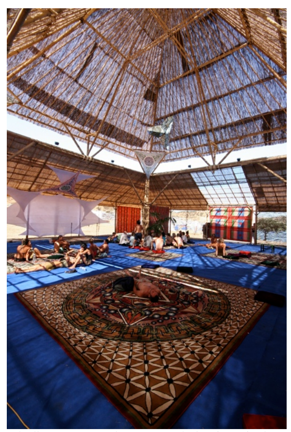
Figure 11: Liminal Village, Boom Festival 2006, Portugal. Photo by jakob kolar <u>www.jacomedia.net</u>