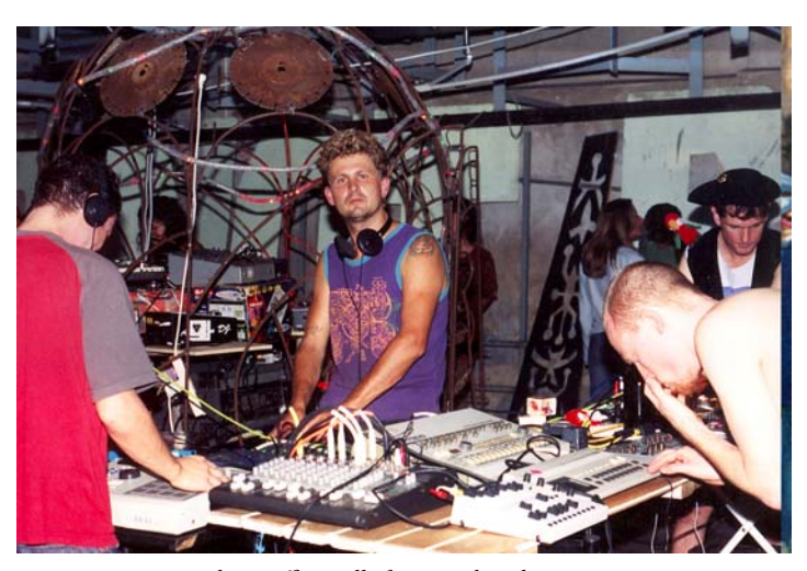
Figure 3: Non Bossy Posse at the Graffiti Hall of Fame.

Agit-house was a product of a recognition made by musicians in early 1990s Sydney that the liberationist messages expressed in their punk acts could be laid down relatively seamlessly with the assistance of samplers, TR808 drum machines, an amplifier and some good bass bins. Exploiting the means by which new audio technologies could effect cut & paste techniques, appropriated and remixed for new purposes and amplified through a PA, punks were programming their dissent to a new rhythm. And since the rhythm was ideally seamless, as multiple artists played long live sets or beatmatched their tracks, bodies were propelled on and on. Thus, unlike punk, this would become a certifiable dance culture - one which, via the rave and with the assistance of MDMA - inherited the palpably non aggressive and non-heterosexualist legacies of house, garage and disco, and the kinesthetic maelstrom of a love-in. But if it was tactile and empathetic, it was also conducive to anarchism – and could remain so as long as a compulsion to bottle the experience and shift it for a tidy sum was kept in check. If this was punk, the exterior would become un-leathered and furrier, accoutrements fluoro and that which enhance the senses, and while alcohol remained present it was no longer dominant.