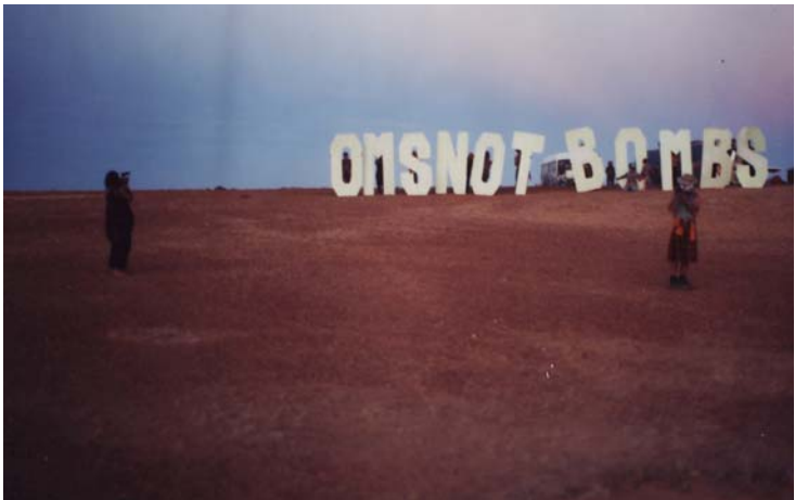
Figure 8, 9: Oms not Bombs (later called Ohms not Bombs)

The collective emerged amid outrage at French nuclear weapons testing in the Pacific. They were originally "Oms not Bombs", the name inspired by Food Not Bombs where the "Om" (③) substitute "represents universal peace in the ancient Sanskrit symbology". They would later become known as "Ohms not Bombs". The