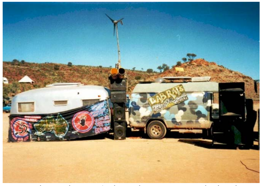
Figure 13: Labrats Sound System at The Claypan, Alice Springs, June 2000.

http://www.youtube.com/watch?v=w86qOuUlBwc Tunin' Technology to Ecology part 2