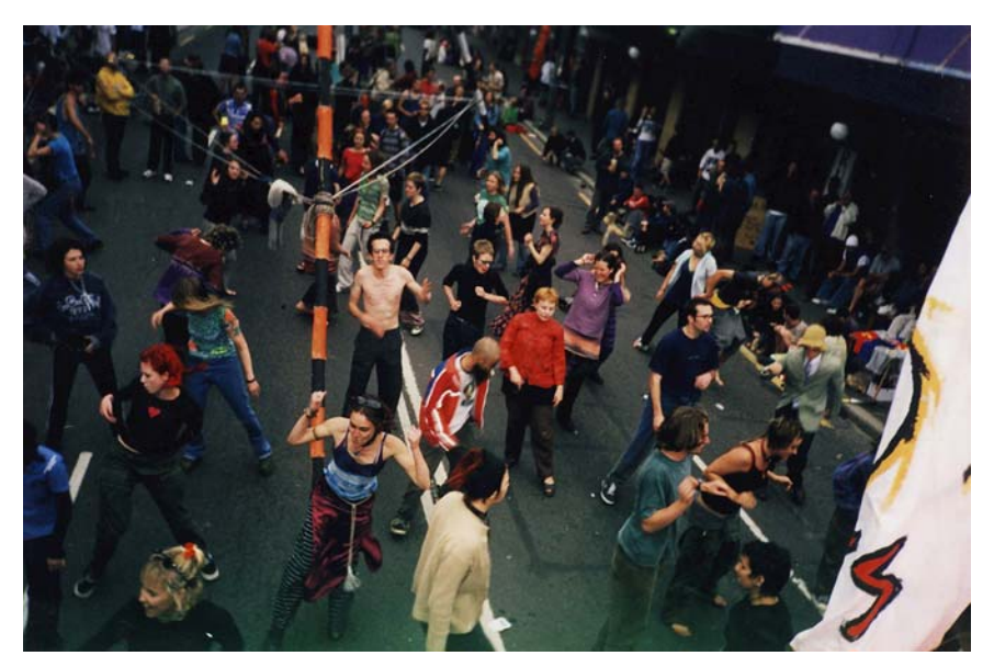
Figure 2: Reclaim the Streets, Newtown, Sydney, 1999.