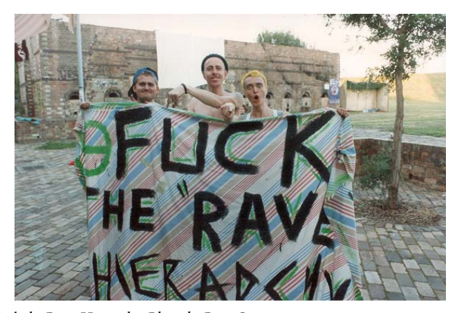
Figure 6: Fuck the Rave Hierarchy.

lians had a name for dance events evincing the crosspollination of anarchistic (inclusive and co-operative) ecological (conscientious and disciplined), digital (looped and optimistic), and transgressive (playful and carnivalesque) sensibilities: "doofs" (see St John 2001b; Strong 2001: 72; Luckman 2003). Anarcho-liminal events "in which people of all races, sexualities and cultural backgrounds can come together", Vibe Tribe's free doofs in Sydney Park combined music, art, video, performance, circus skills and interactive installations (Strong 2001: 74). Their first party, A-May-Zing, on May Day 1993 in Sydney Park, saw "an anarchist picnic mutate into a full on free party all-nighter" (Strong 2001: 74). Posters promoted the event as a "celebration of resistance" which involved Sub Bass Snarl, Gemma, Ming D and Non Bossy Posse. On that night, as Strong recalls: "a huge banner emblazoned with the words 'Fuck the Rave Hierarchy' was strung aloft".