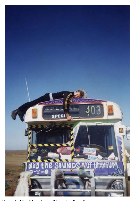
Figure 10: Dig the Sounds Not Uranium.

brainchild of expatriate Londoner Strong, Ohms renovated an old State Transit bus and drove it around Australia on their 1998 Dig the Sounds Not Uranium tour.