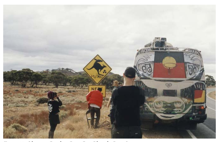
Figure 12: Ohms not Bombs – Peace Bus.