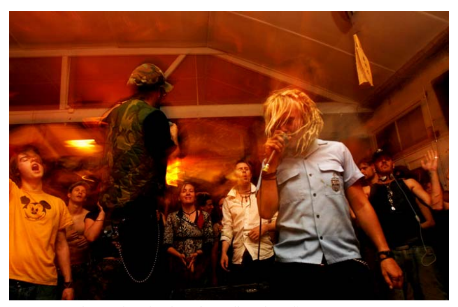
Figure 14: Combat Wombat.