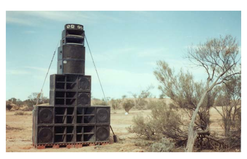
Figure 1: Outback Stack.

techno, anarcho-punk, hardcore, sound systems, postcolonialism, Sydney techno-punk scene