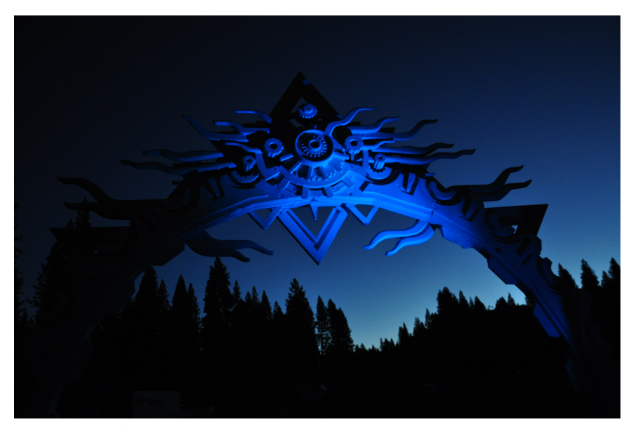
15. Entrance to the main stage

As a self-identified festivals of "Art, Music, and Conscious Living", this is one of the true psychedelic festivals in the US and, alongside Burning Man, succeeds in combining music and art, while impressing a "leave no trace" awareness upon its participants. Additionally, the friendliness and openness of participants, mainly Americans, was wonderful for me as a visitor and photographer.