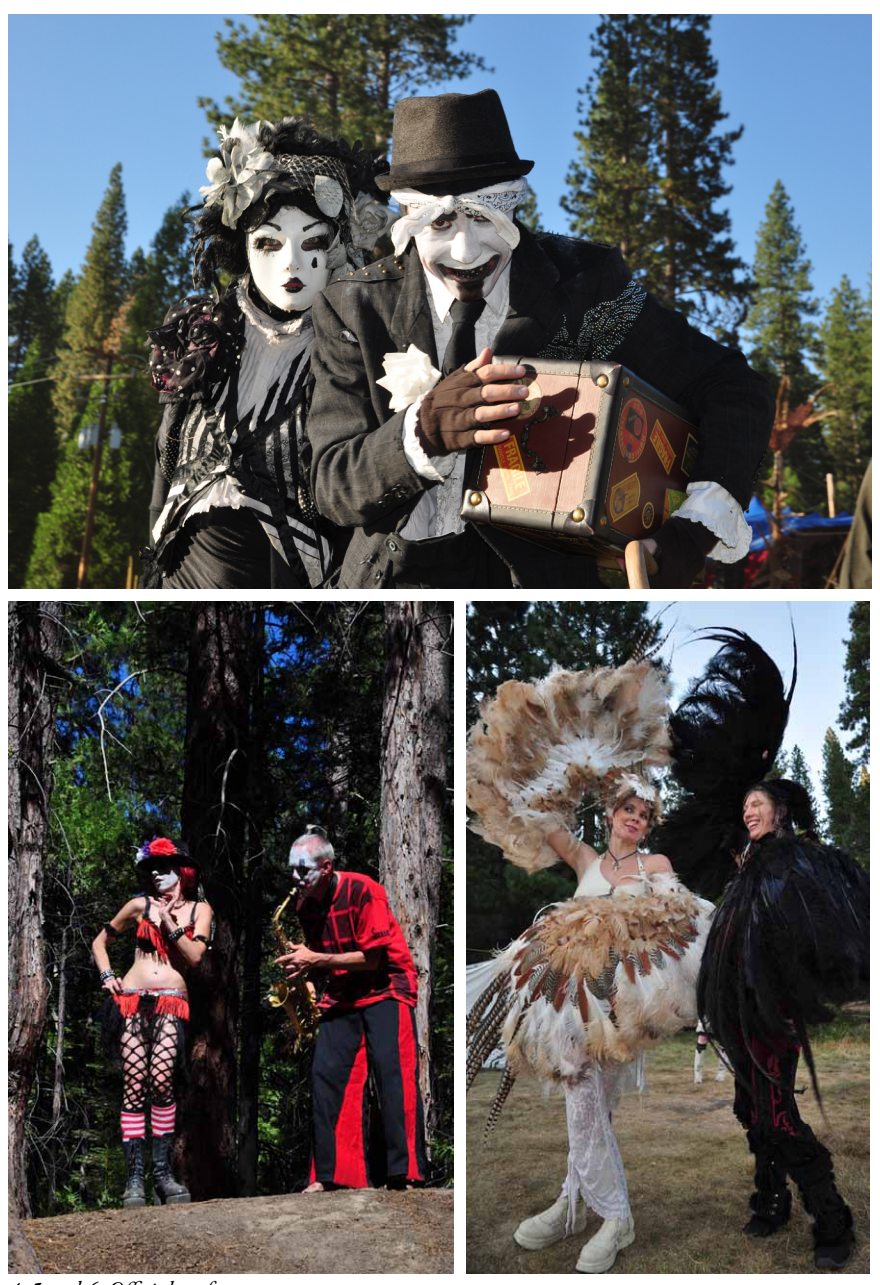
4, 5 and 6. Official performances

The music performed was diverse, with DJs and bands from the psytrance, progressive, dubstep and world music scenes. For much of the time, I could not distinguish between the performances on the stage and those on the dancefl oor. Every second person looked like a Cirque de Soleil artist.