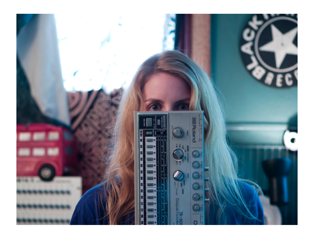
FIGURE 3. THE DOUBTFUL GUEST POSES WITH HER FAVORITE DRUM MACHINE, THE ROLAND TR-606, LONDON, UK. PHOTO BY: MAGDALENA OLSZANOWSKI (2011).

[V]iewing these [female] writers as a separate tradition is not isolationist; rather, it is a strategy in recovering them, in making them an object of discourse. Separation is a means of offering women writers visibility that they would not otherwise possess and enabling discussions that could not otherwise proceed.