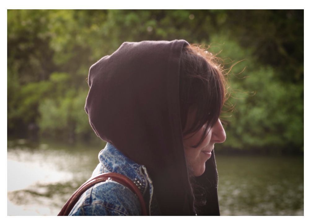
FIGURE 2. SUBEENA/ALIS AT THE PARK, LONDON, UK.