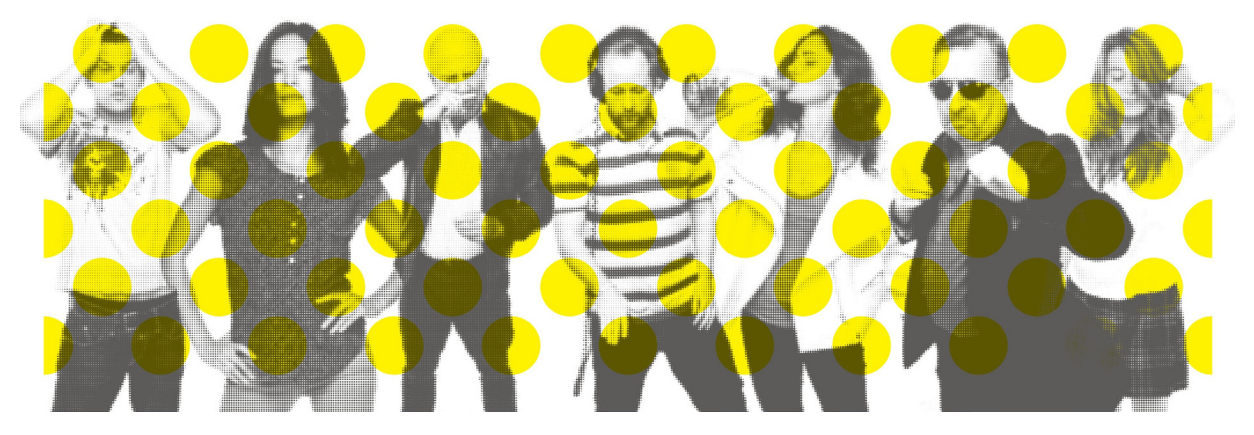
FIG. 1. MARKETING POSTER FOR IRVINE WELSH'S ECSTASY BY HEYDON (2012).

Based on the #1 book by Irvine Welsh author of 'Trainspotting'