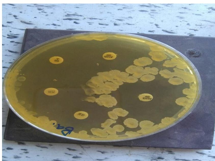
Figure 1. show Antibiotic Susceptibility test of bacillus to different antibiotic