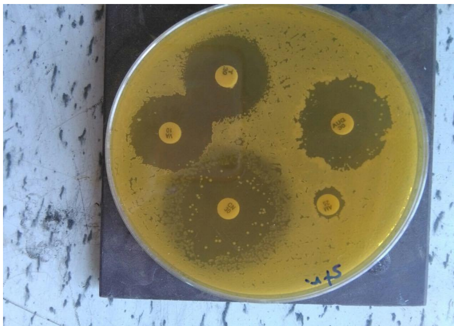
Figure (3) show Antibiotic Susceptibility test of streptococcus to different antibiotic .