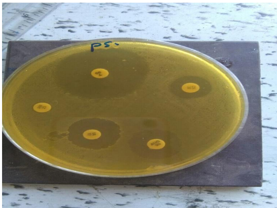
Figure 4. show Antibiotic Susceptibility test of Pseudomonas to different antibiotic