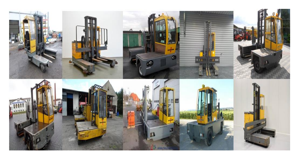
Figure 1 . The alternatives in a multi-criteria model

The Euro-Roal company owns several forklifts over 20 years of age and, in order to improve and refine their fleet, 10 alternatives (Figure 1) (side-loading forklifts) will be evaluated. One of them, which would be suitable for the Euro-Roal, will be selected.