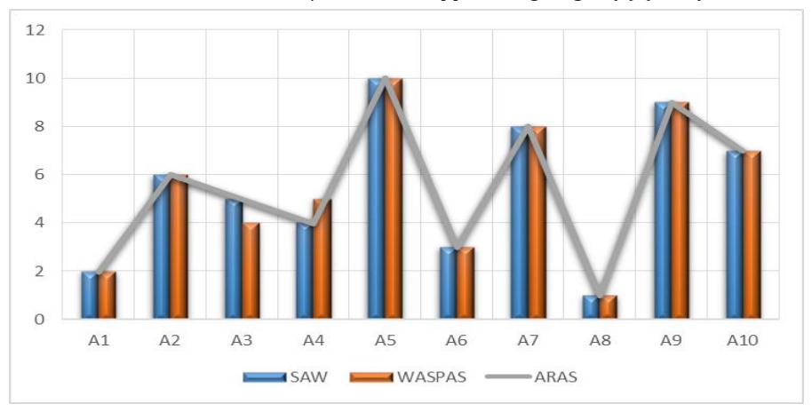
Figure 2. Sensitivity analysis