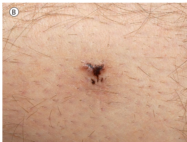
Figure 1. (A) Clinical picture of a small brown papule. (B) Clinical closeup.