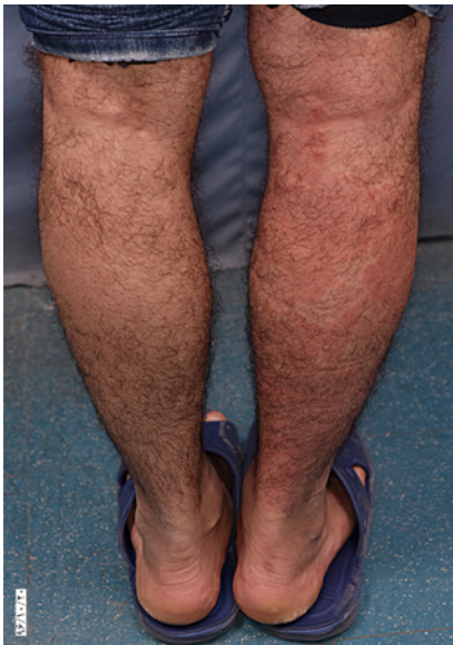
Figure 1. Development of urticarial plaques on the right leg after 15 minutes of the leg hanging.