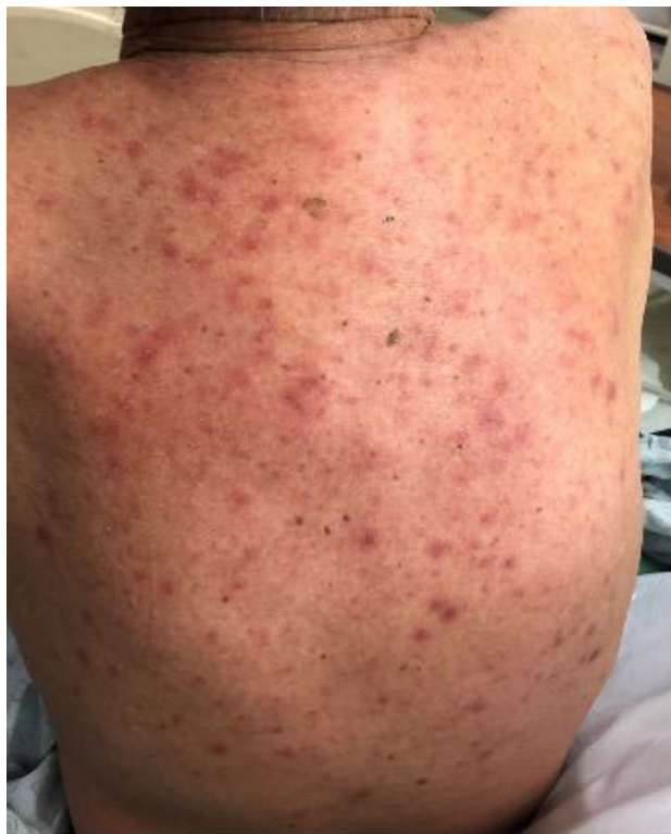
Figure 1. Erythematous swollen papulopustules on the back.

prominent eosinophils (Figure 2). GMS, Gram, AFB, and PAS stains were negative. Biopsy findings were consistent with EPF, likely associated with the patient's immunosuppression. The patient was treated with triamcinolone acetone cream and showed gradual resolution.