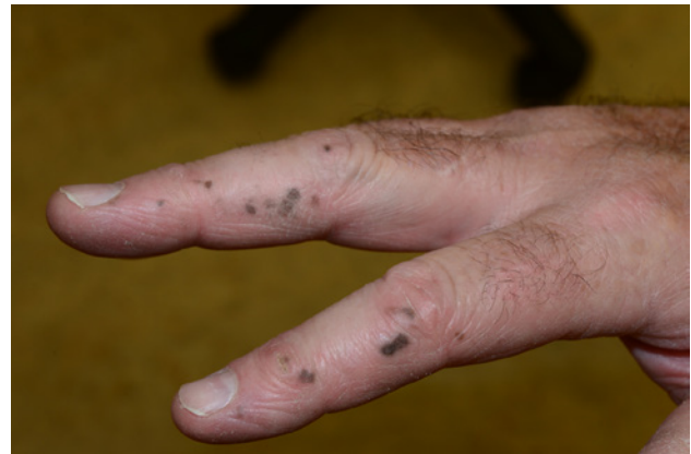
Figure 3. Clinical manifestations of the pigmented macules of the lateral aspects of the second and third right finger.

patient's history was significant for melanoma in situ which was treated five years prior to the onset of the pigmentation of his lips and fingers. The patient was a non-smoker and he had no other relevant medication history. The patient denied a history of trauma or exposures to heavy metals. There was no familial history of pigmentary disorders and digestive polyposis or tumors.