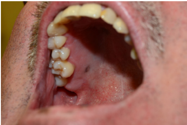
Figure 2. Clinical manifestations of the pigmented macules located on the hard palate.