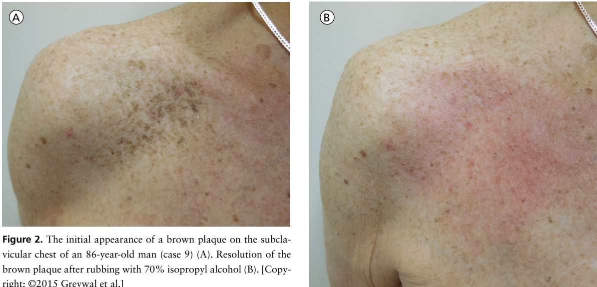
Figure 2. The initial appearance of a brown plaque on the subclavicular chest of an 86-year-old man (case 9) (A). Resolution of the brown plaque after rubbing with 70% isopropyl alcohol (B).

tomatic dermatosis. All patients practiced good hygiene and showered a minimum of every other day or daily. In addition, with the exception of one patient (case 4), all were capable of reaching the affected locations while showering. Most of the lesions (except case 6) were located on concave sites (Figures