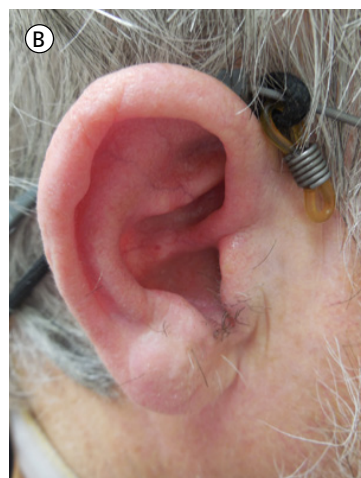
Figure 5. Terra firma-forme dermatosis in a 66-year-old man (case 4). Initial presentation of black and brown papules and plaques on the concha of the right ear (A). Resolution of all pigmentation after the application of 70% isopropyl alcohol (B).

the patients had other medical conditions that were most likely a reflection of their age and not a predisposing factor to terra-firma forme dermatosis. Several patients had a history of non-melanoma skin cancer (cases 3, 4, 5, 7, 8, and 9), while only one patient had a history of melanoma (case 9).