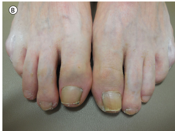
Figure 4. Clinical presentation of terra firma-forme dermatosis in a 58-year-old man (case 2). Brown plaques affecting the interspaces between the first through fourth toes, bilaterally (A). Clearing of terra firma-forme dermatosis after wiping with 70% isopropyl alcohol pads (B).