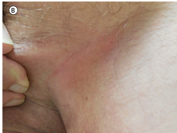
Figure 3. An 82-year-old man (case 8) with a hyperkeratotic brown plaque in the inguinal fold, as seen on initial presentation (A). Clearing of the lesion in the inguinal fold after aggressive wiping with 70% isopropyl alcohol pads (B).