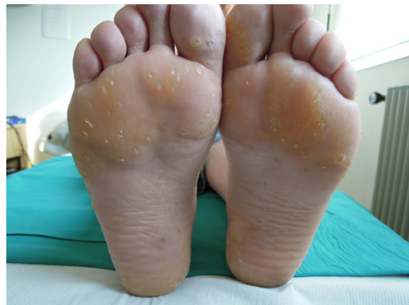
Figure 2. Numerous depressed pits of different sizes on the soles.