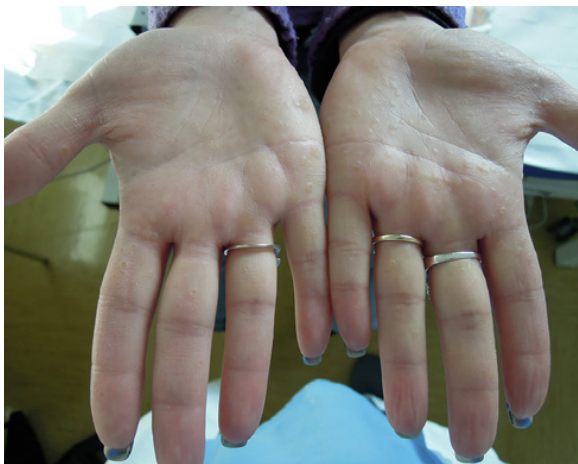
Figure 1. Multiple keratotic crateriform papules over the palms.