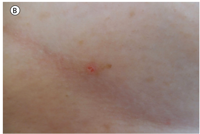
Figure 1. Distant (A) and closer (B) views of an acantholytic dyskeratotic acanthoma. The lesion appears as an erythematous plaque with central area of erosion.

dyskeratotic acanthoma and summarize the acantholytic dyskeratotic acanthomas (30 cutaneous and 3 subungual) that have been described in literature during the past 30 years.