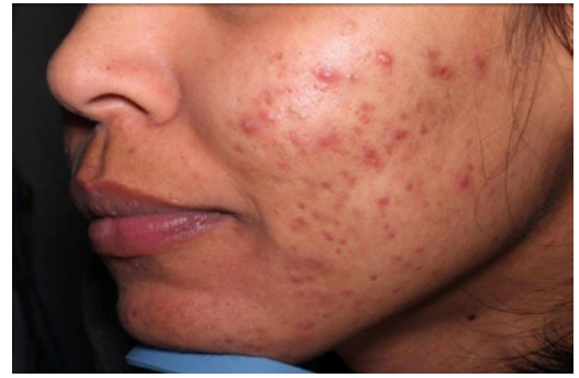
Figure 2. Papulopustular acne lesions of the face and erythematous acne scars due to past treatments.