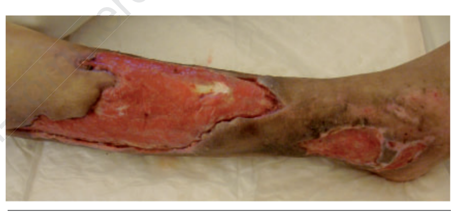
Figure 1. Group A \beta -hemolytic streptococci with involvement of the deeper layers of the skin and subcutaneous tissue, spreading across the fascial planes of the subcutis.

nificantly increased >8000 pg/mL [<100]. There were complaints of arthralgia of the left elbow. There were no other signs of acute rheumatic fever (ARF) and no signs of pharyngitis in the whole period. Chest X ray and HR-CT of the thorax showed changes in both lungs consistent with old tuberculosis. Two weeks after the first analysis, renal function had improved and Uprotein had decreased to 2.6 g/24 h, creatinine 139 umol/L, BUN 9.5 mmol/L. Ultrasound of the kidneys was normal. Echocardiography still