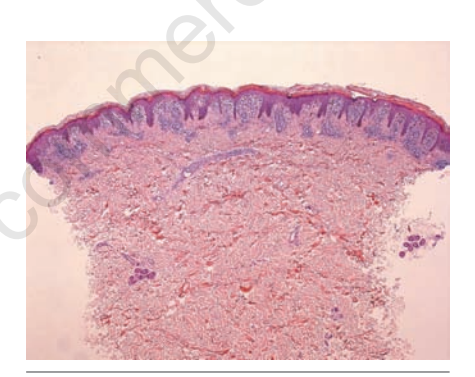
Figure 1. Low power magnification of lesion biopsied on initial presentation.

The report by Isaacson et al. expanded SALE to include other types of lichenoid eruptions such as hyperpigmented plaques, pinpoint papules, and lichen planus (LP)-like papules, considering them part of a spectrum of actinic lichen planus (ALP), but preferring the term SALE.<sup>2-4</sup> In a later report of nine patients with ALN, Hussein argued against using the broader term SALE. He reported the co-occurrance of ALP and ALN in two of the nine patients, which would appear to be the case in our patient with a diagnosis of ALN and who later presented with oval violaceous plaques on her neck and forearms, a clinical picture more consistent with ALP. ALN and ALP present mostly in children and young adults with darkly pigmented skin, following significant sun exposure. ALN, a rare photo-induced eruption, shares the same histological features as lichen nitidus