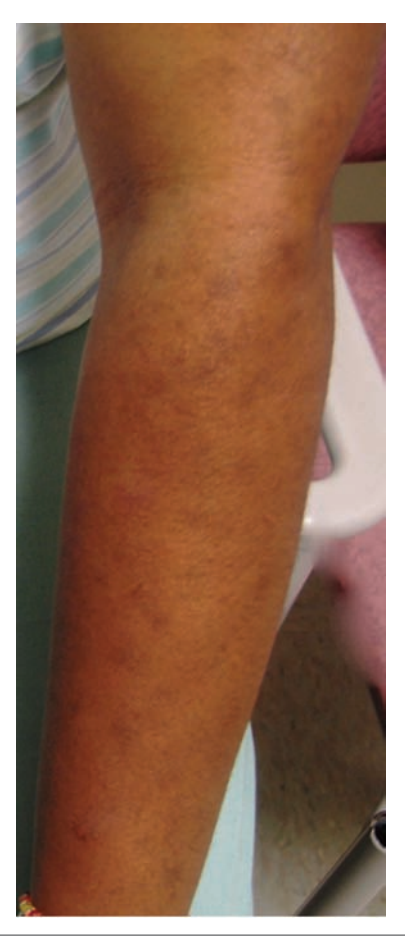
Figure 3. Clinical presentation on followup visit.

©Copyright T.W. Blalock et al., 2010 Licensee PAGEPress, Italy Dermatology Reports 2010; 2:e10 doi:10.4081/dr.2010.e10