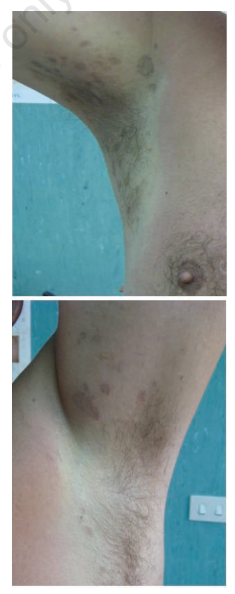
Figure 1. Dark-brown macules with central resolution in both armpits.

©Copyright F. Tripodi Cutrì et al., 2011 Licensee PAGEPress, Italy Dermatology Reports 2011; 3:e46 doi:10.4081/dr.2011.e46