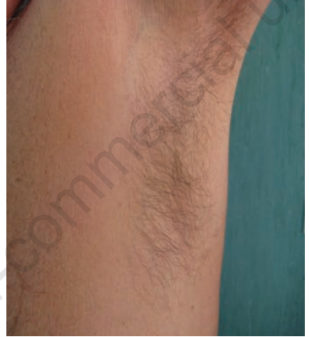
Figure 4. Almost complete clearing up of the macules in both armpits three months later. Scar lesion ensued from biopsy the right armpit.