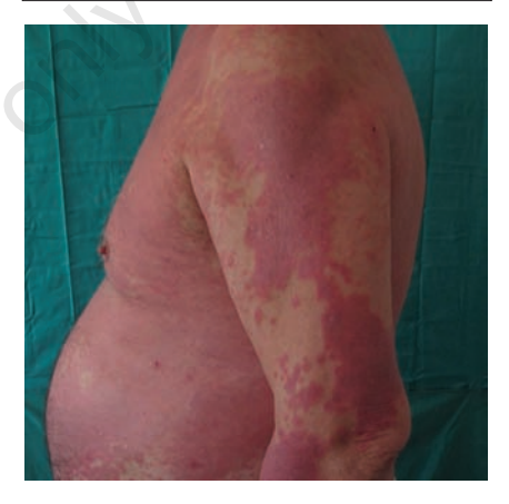
Figure 2. Cutaneous affection of the forearm.

©Copyright R. Ruiz-Villaverde and M. Galan-Gutierrez, 2011 Licensee PAGEPress, Italy Dermatology Reports 2011; 3:e31 doi:10.4081/dr.2011.e31