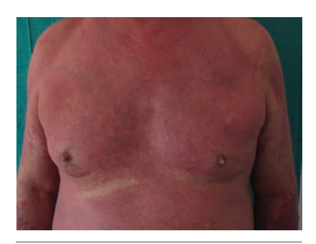
Figure 1. Confluent eruption of erythemato-violaceus plaques on the chest.

Lichenoid drug eruptions are commonly associated with gold, antimalarials, thiazides and phenotiazines. We should note that although the morphology of lichenoid eruptions is reminiscent of lichen planus, the following differences may occur.<sup>3</sup> i) beginning as hyperpigmented lesions or eczematous lesions; ii) do not present Wickham striae on