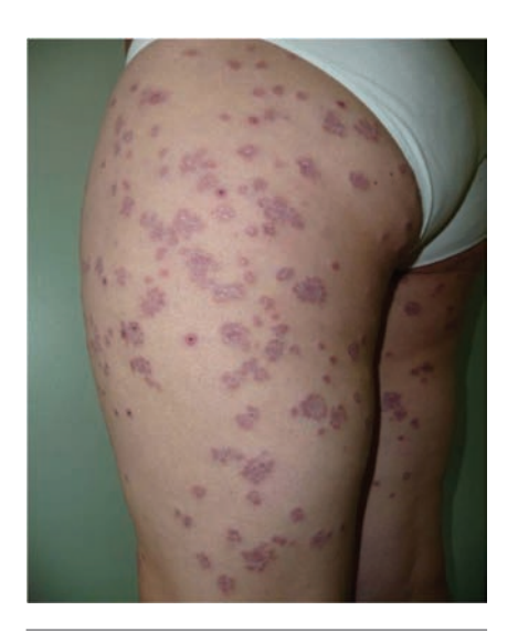
Figure 1. Involvement of inferior limbs.

PNT is a rare condition, occurring predominantly in children and young adults. The majority of cases occur in patients infected with M. tuberculosis , but some cases have been reported after bacillus Calmette-Guérin (BCG) vaccination<sup>1</sup>. It occurs in less than 5% of active tuberculosis cases even in populations with a