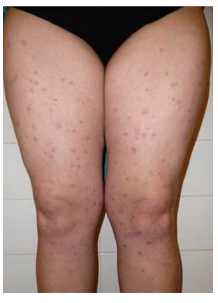
Figure 3. Clinical improvement after 2 weeks of treatment.