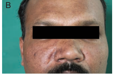
Figure 1. A) Partially defined edematous and erythematous plaque on right malar region, nasolabial fold and lower eyelid with follicular dilatation. B) Comparisson of the lesion with contralateral normal site.