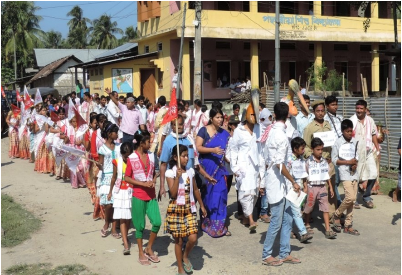
Figure 3 A cultural procession for stork conservation.

in conservation program activities and even voluntarily published a roadside sign with conservation messages about the storks in the area. The involvement of police made a real difference and poachers did not have the courage to disturb or kill storks in the colony.