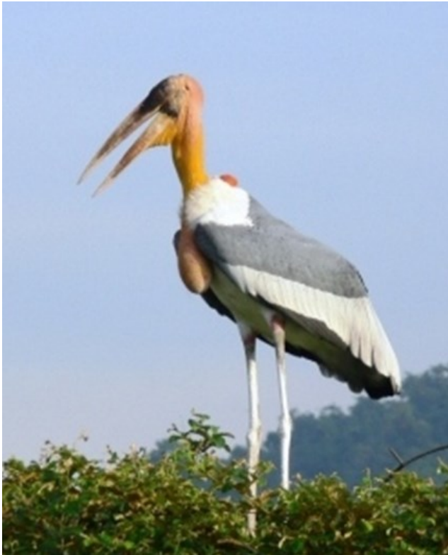
Figure 1 Greater Adjutant Stork in Assam.

Knowledge of breeding sites of Greater Adjutants in India was limited to 75 sites found during a survey conducted in 1989 and 1990 in Assam (Saikia and Bhattacharjee 1990a, 1990b). The largest colony had 31 nests, with most of the nests in private forest areas in villages and suburban areas. Threats to the species were identified as the killing of storks, felling of nesting trees for wood or to remove storks due to dislike of the noise and smell of nests with young birds, lack of awareness of the species and its status as legally protected, and the loss of wetland foraging habitat (Saikia and Bhattacharjee 1990b).