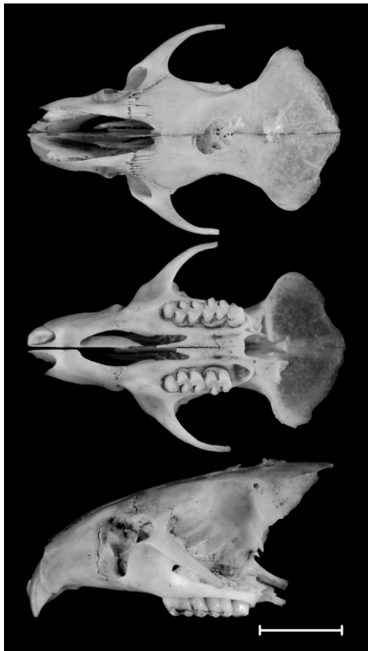
Figure 2. Dorsal, ventral and lateral views of cranium of Akodon oenos (MHNSR 15.002). Scale: 5 mm.

7.1), and Akodon molinae (MNI% 3.6). A single hystricognath rodent Galea leucoblephara (MNI% 28.6) was recorded, and one chiropteran Tadarida brasiliensis (MNI% 3.6), and one marsupial marmosine Thylamys pallidior (MNI% 3.6). The modern small mammal assemblage also contained one exotic lagomorph (MNI% 7.1).