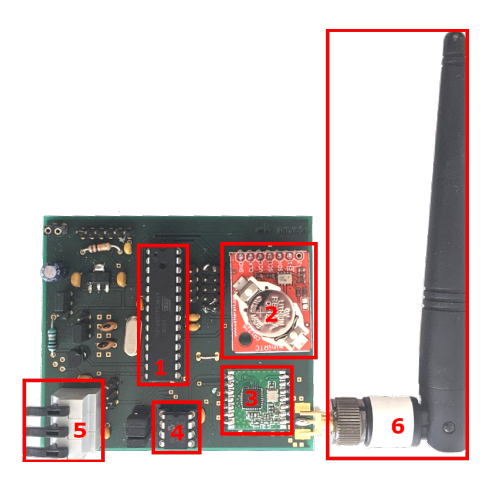
Figure 2: A MoleNet sensor node.

only once a day, further decreasing the power consumption.