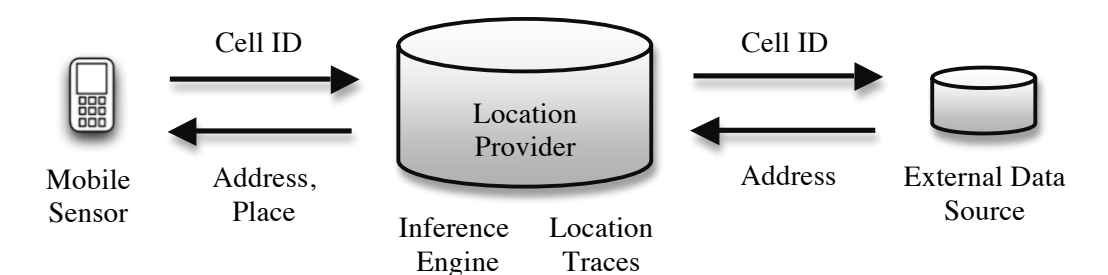
Figure 1: Simplified context aggregation

The main objective of the CMF is to allow for developing context-aware (mobile) applications that gather context data from various sources. Raw context data, e.g. sensor outputs like the currently visible cell ID on a mobile phone do often not provide meaningful (human understandable) information right away. Instead, the aggregation of such context data and the subsequent combination with other pieces of information is regarded as an essential process to enable the development of intelligent applications that make sense of the user's surrounding. Figure 1 illustrates a simplified context aggregation to resolve a user's current location and to reason about his location traces recorded over time.