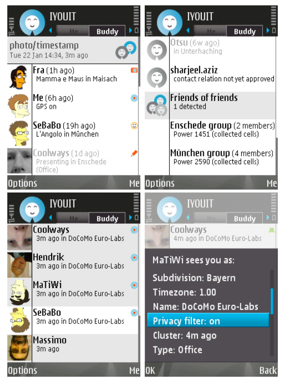
Figure 5: IYOUIT's buddy tab

IYOUIT is a research prototype that represents our prime implementation of the CMF to apply context-aware technologies and methodologies in practice (including ontology-based