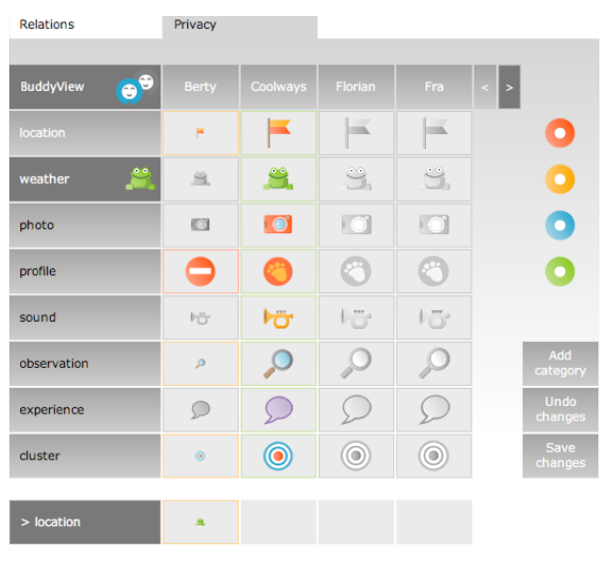
Figure 4: PrivacyManager Web-interface

Web-based User Interface: This interface integrates most access control and social networking features into one compact and easy to use matrix-like interface, shown in Figure 4.