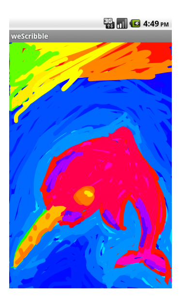
Figure 1: The weScribble application for Android.

update their canvas accordingly. If a user temporarily disconnects from the network, he or she can keep drawing and those changes will be synchronized with the other users in the session upon reconnection.