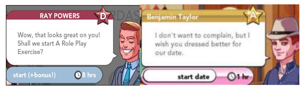
Figure 6. Either in Dating or Working The Player's Character Will be Judged to "Pay Attention What You're Wearing for !"

The player's character is never assigned to a quest in dieting or doing plastic surgery since they are created with the face that always ready on-screen and the body of a Western model type that globally 'bankable', especially with the lucrative associations such as Kardashians and their relatives. However, such normalization to those requirements of aesthetic and glamour labors become one of the possible successful strategies to leads player to visit Kustomize (Wardrobe feature) as frequent as possible, tap the feminized action repetitively, collect in-game soft currencies, and at last back to back purchase the major ingame celebrity enhancement such as virtual outfits. This is articulated in Morrison's study (2016) that stated the dominant discourses in KK: H assigns power to notions of idealized beauty and brand loyalty although within a symbolic economy in a virtual space (p.244). Additionally, with the aforementioned entertaining narrative that persistently involves the player to the system, the game empowers the player to defend the logic of beauty for beauty's sake because in reality, the dominant aesthetic logic determines the value of high-end celebrity.