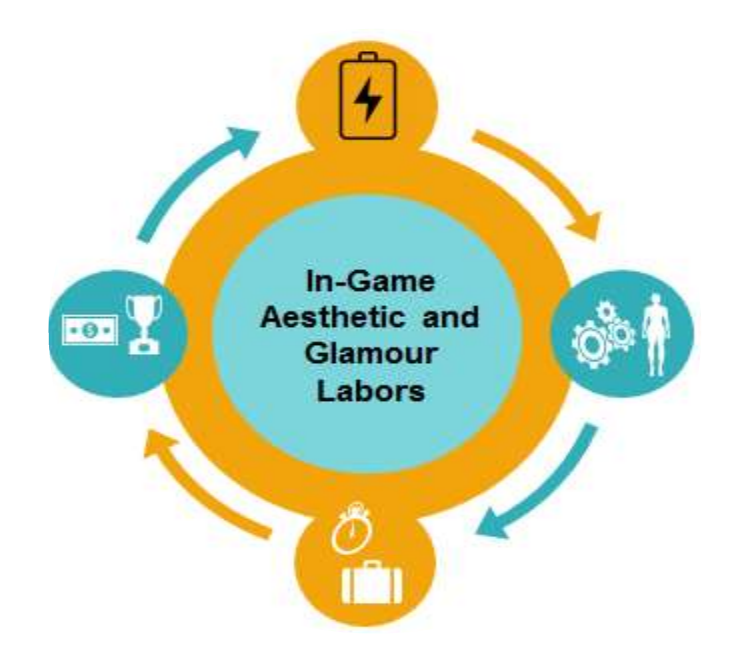
Figure. 4. The Flow of KK: H Drive System

Gathering the ideas and the interrelated functions of energy, in-game actions, and achievements, depicts the real system of work in reality. In the physical world, any kind of works in the realm of labor drains a lot of energy. It takes mental and physical efforts to do something that is bound to corporate codes. Even the works of changing clothes, checking makeup, smiling, posing, charming, facing the camera, socializing, and waving that are displayed as the in-game actions could be sensed as too imperative since they involve the serious physical discipline and emotional management (Holla, 2015, p.4) as aesthetic and glamour labors in real life. KK: H manifests the difficulties of achieving a good performance in the workplace by developing the form of energy that limits the intensity of performing work actions and akin to wages rather than physical need.