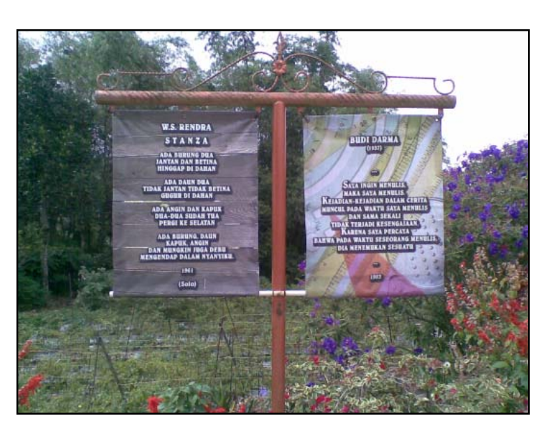
Figure 2: Poems written by W.S. Rendra and Budi Darma

How to build originality in objective writing as a scientific paper? Guidelines for Scientific Writing in UPI (Indonesia University of Education), in 2014, contains some explanations regarding the originality